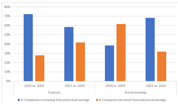
Figure 1 % of Companies Increasing/Decreasing Forecast and Actual Earnings for D 12

If we refer the analysis to the forecasts 3 months before the year-end, the results obtained also show significant differences between the deviations observed in three financial years (Table 5).